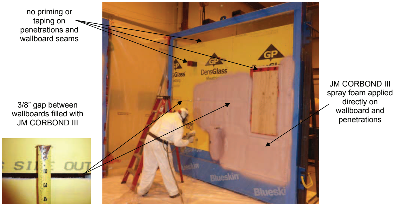
Figure 3. JM CORBOND III ASTM E2357 testing without priming and taping penetrations and wallboard seams.

using standard application techniques - no additional preparation. The superior performance of JM CORBOND III spray foam designed specifically with adhesion promoters results in product characteristics that outperform the other medium density polyurethane spray foams.